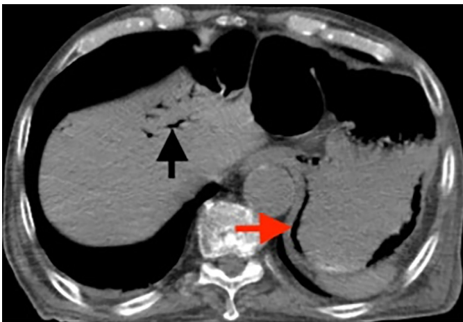
Figure 1. CT image of emphysematous gastritis and air in the portal venous

Throughout hospitalization, his inflammatory markers showed improvement and abdominal tenderness resolved.